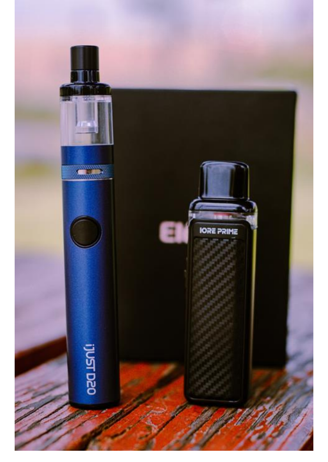
"Increase in E-Cigarette Sales Shows Need for FDA to Finish Premarket Review Process"

The Centers for Disease Control and Prevention (CDC) Foundation and Truth Initiative released data showing that from January 2020 to December 2022, there was an increase in e-cigarette unit sales by nearly 47% and an increase in the total number of e-cigarette brands sold by 46.2%. An increased proportion of unit sales were seen among products favored by youth including products with fruit, candy and sweet flavors.