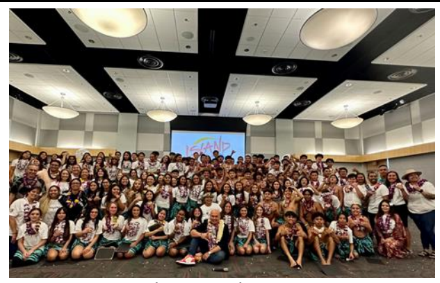
Island eNVy Inspire Summit

SNHD Tobacco Control Program's Native Hawaiian and Pacific Islander initiative, Island eNVy hosted the Inspire Youth Summit in July 2023. Over 120 teens participated in cultural enrichment and educational experiences, including hula, ukulele, history, language, and health topics.